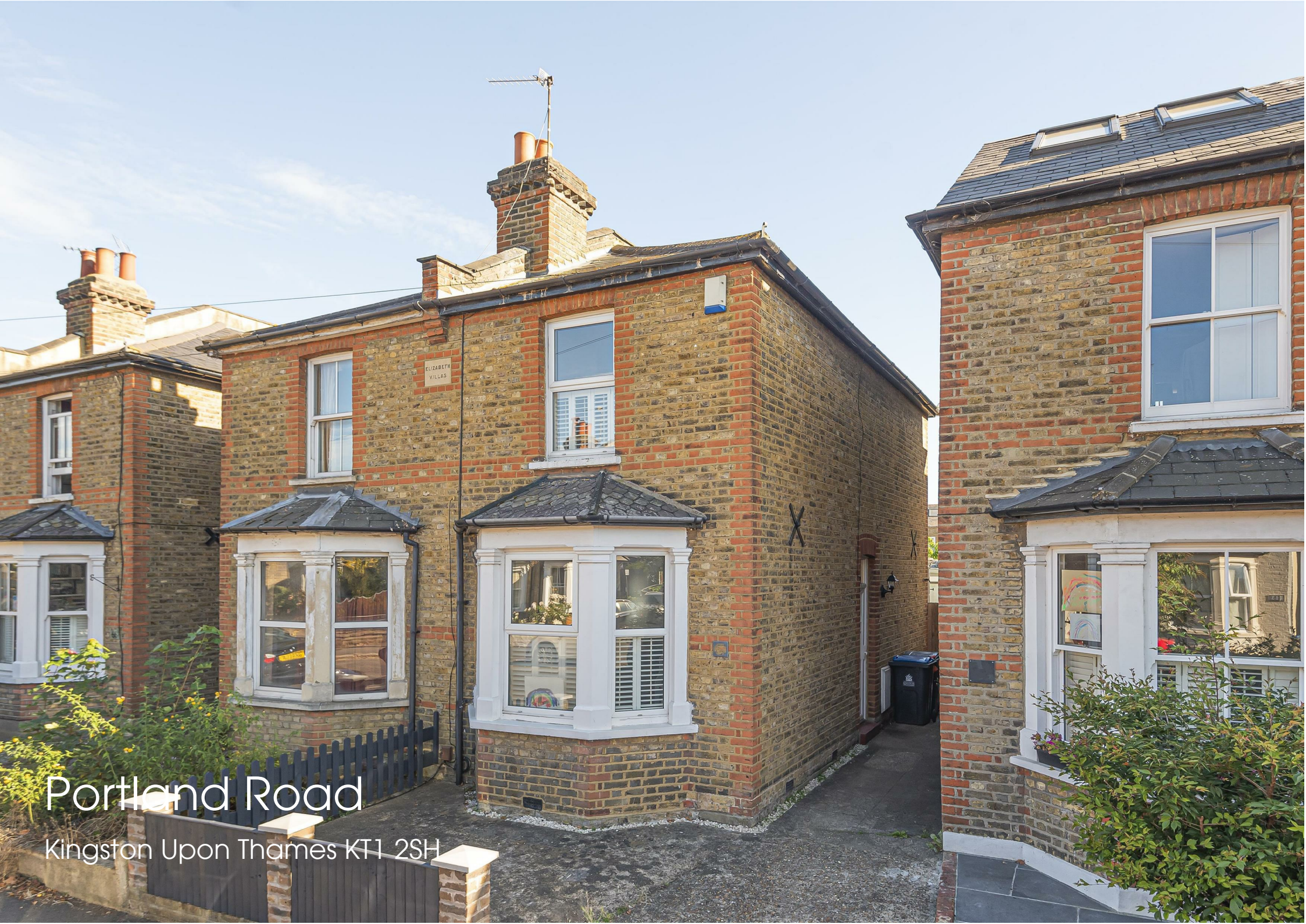
Portland Road Kingston Upon Thames KT1 2SH